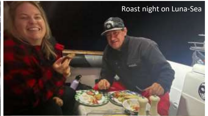
Roast night on Luna-Sea